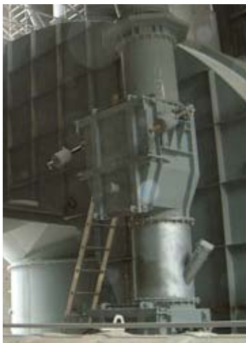
Installed A TEC Pendulum Flap